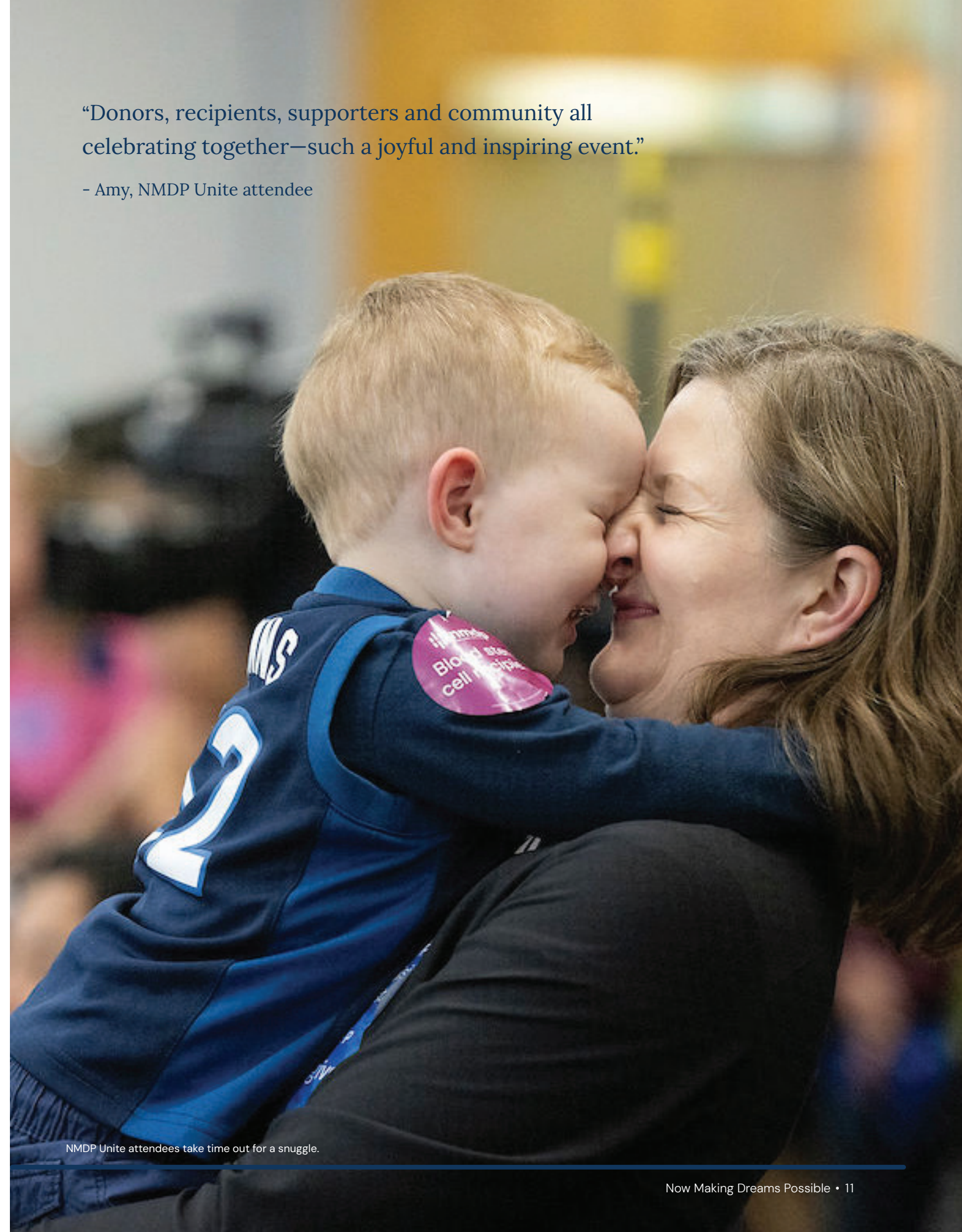
NMDP Unite attendees take time out for a snuggle.