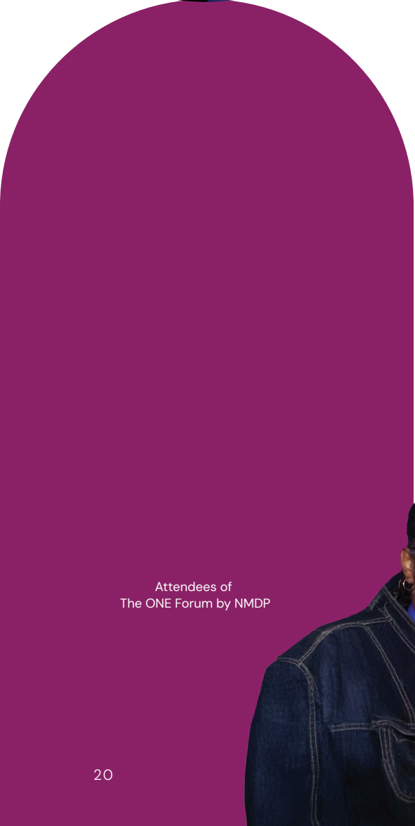
Attendees of The ONE Forum by NMDP